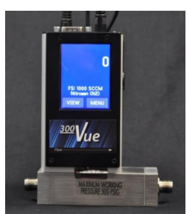
Figure 2 HFM-D-300B Vue Flow Meter w/ Color Touchscreen Display Accuracy: ±(0.5%PT+0.2%FS)

Another important consideration when selecting the proper instrument is avoiding what is known as "fold-over". This problem arises in some typical flow meters when they actually misreport a very high (over-range) flow as a normal flow, and allow a bad part to pass. Teledyne Hasting's 300 Series sensor design correctly interprets over-range flows; its output signal will not come back on scale. The HFM-300 will not report false acceptable readings.